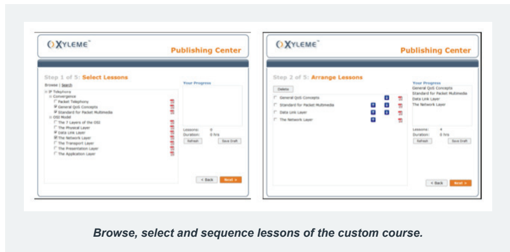
Browse, select and sequence lessons of the custom course.

Xyleme, Inc +1.303.872.0233 www.xyleme.com sales@xyleme.com